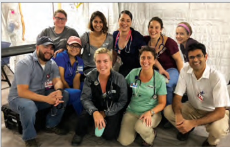
Team One medical volunteers in Fajardo, Puerto Rico