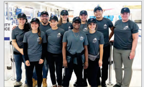
Team Two volunteers preparing to leave New York

Conditions in Puerto Rico were austere after Hurricane Maria made landfall on Wednesday, September 20, 2017, pushing 155 mph winds across the island with the same force as a thunderous tornado 50 to 60 miles wide and leaving utter devastation to the infrastructure, power grid, and water supply.