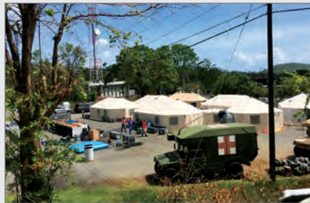
Volunteers helped manage a walk-in clinic and triage area.